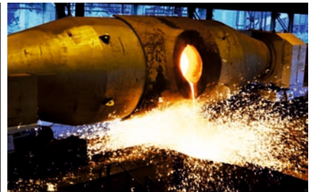
▲ Torpedo ladle at SAIL Rourkela

Maintaining its dominant position in the Indian steel market, SAIL is continually improving to reach new heights of world - class product portfolio with enhanced capacities, backed by sustainable processes & practices.