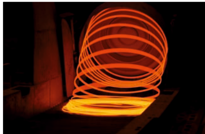
▲ Wire rods at SAIL Burnpur