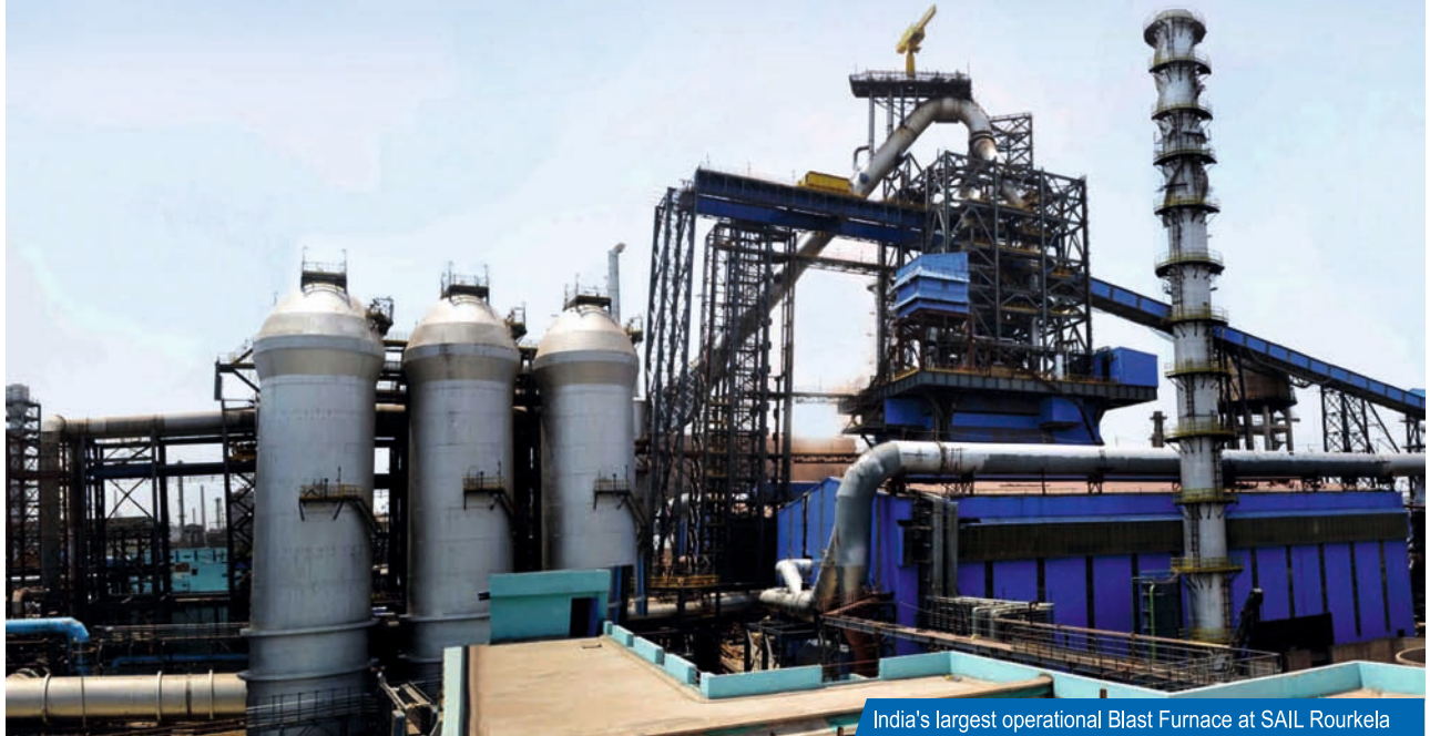
India's largest operational Blast Furnace at SAIL Rourkela